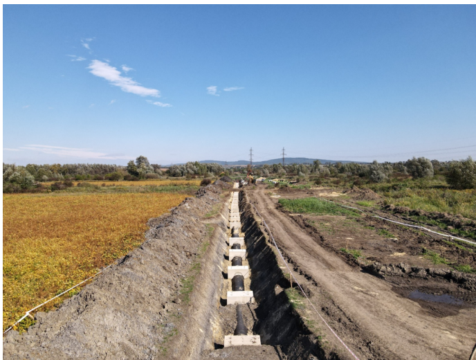
A water pipe is being rehabilitated in Chernivtsi.

Priority investments include the rehabilitation of three sections of the main transmission water pipe of the city, of a raw water intake, sections of the water supply and sewage network as well as the partial reconstruction of the wastewater treatment plant, including waste water pumping stations.