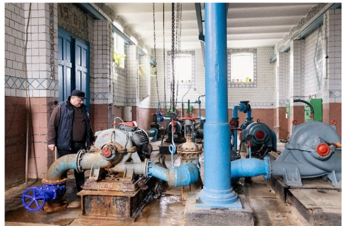
This water pumping station has been operational since 1895.

Within the overall programme, about 11km of water pipes will be rehabilitated. Technical Water losses will be reduced by about 20% and it is anticipated that the interruptions of the water supply of Chernivtsi can be reduced by 300 hours per year. In total about 190.000 people will benefit from improved access to drinking water. Furthermore, the water quality will be brought closer to EU standards – an important step on the way to EU integration.