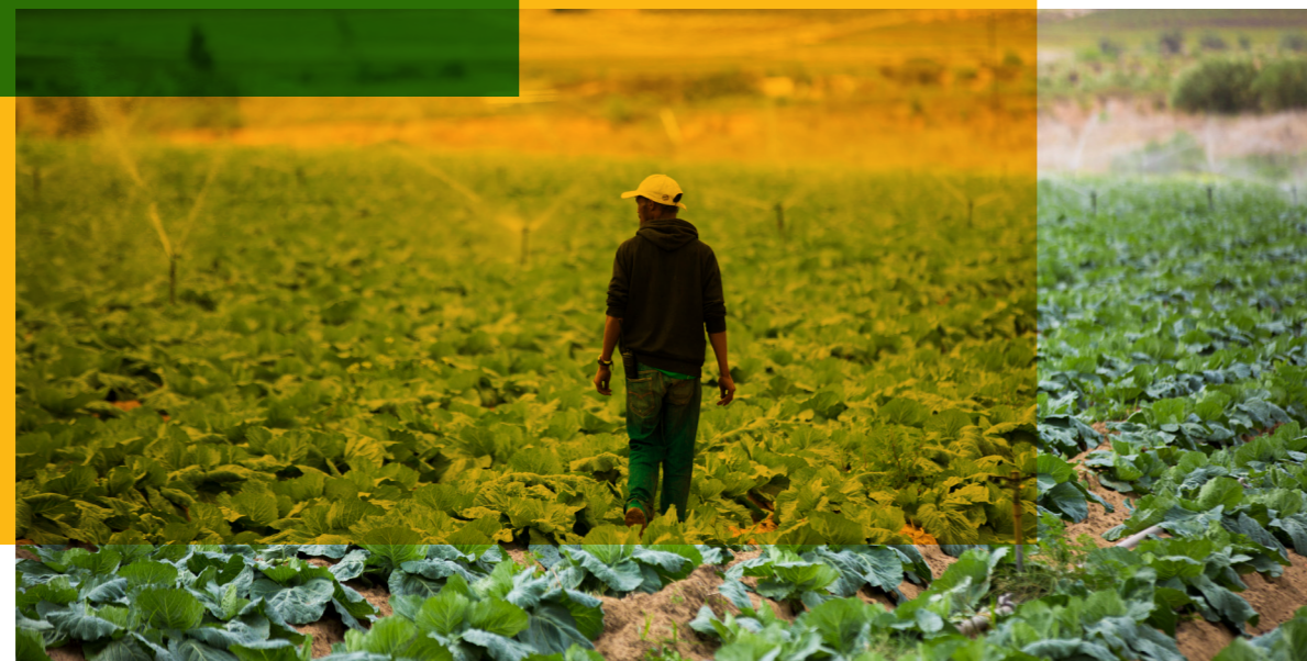
Reuse of water from modernised sewage plants to alleviate water shortages in Cape Town, South Africa.