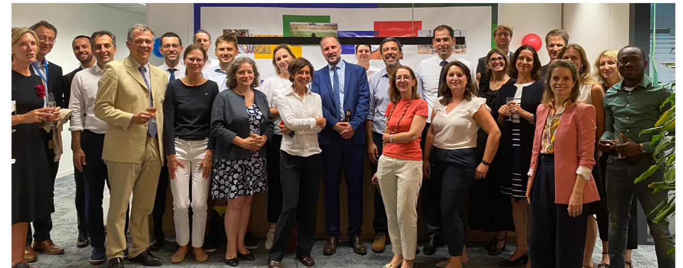
JEFIC partners' workshop at their common Brussels office.

Alongside this negotiation, JEFIC members have worked on building up an extensive pipeline of common projects in different sectors around the world for the coming years.