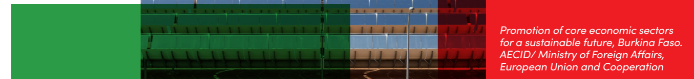
Promotion of core economic sectors for a sustainable future, Burkina Faso. AECID/ Ministry of Foreign Affairs, European Union and Cooperation