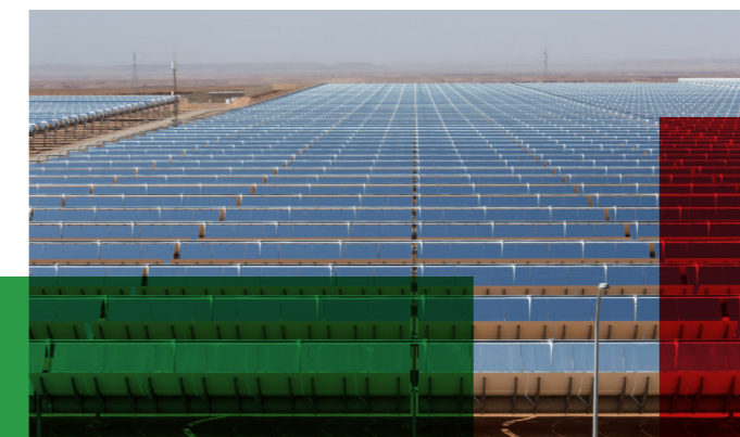
Solar panels at the Ouarzazate solar power plant, Morocco.