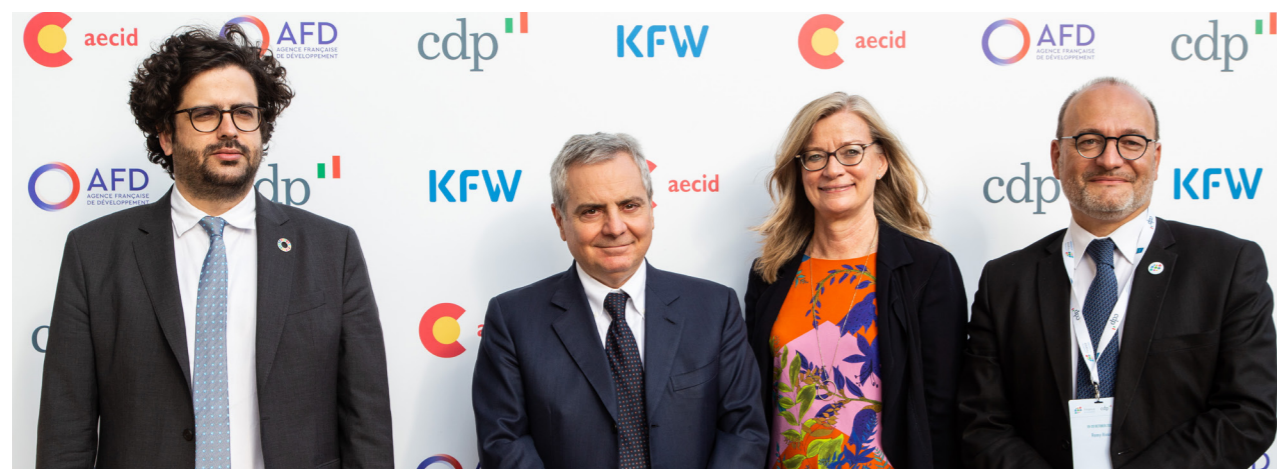
JEFIC partners during the signature of the Joint Declaration in Rome (October 2021).