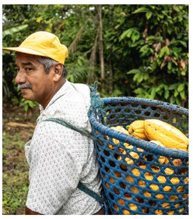
↑ At the cocoa harvest, here in Latin America.

To halt this trend, new economic practices are needed alongside effective nature conservation. The economy must become "green", which requires incentives and capital. The eco.business Fund is an instrument that works towards this goal and promotes economic activity that contributes to the sustainable use of raw materials and the preservation of biodiversity. It also helps to mitigate climate change and adapt to its negative impacts. The fund was established in 2014 by KfW Development Bank on behalf of the Federal Ministry for Economic Cooperation and Development (BMZ) together with Conservation International and Finance in Motion.