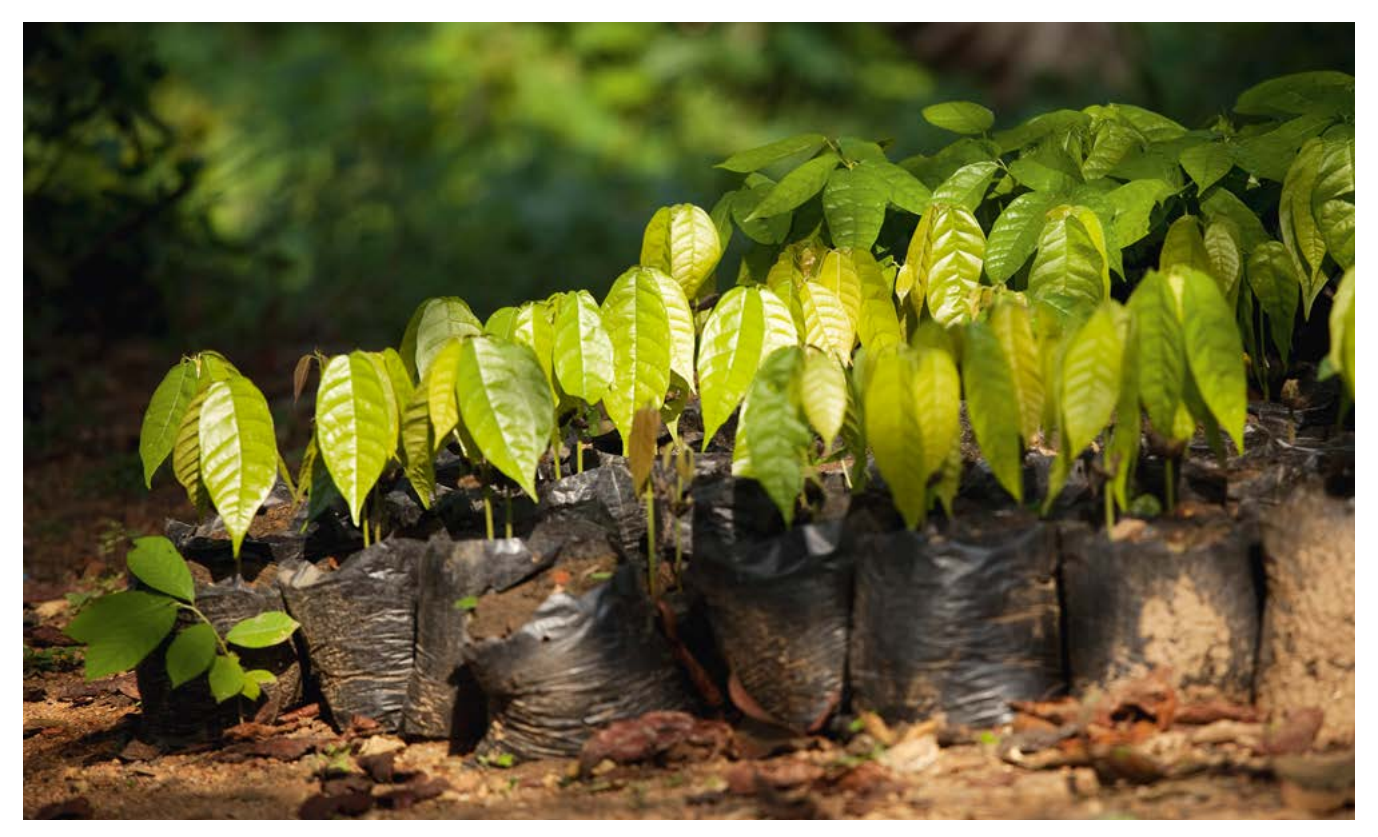
↑ Cocoa seedlings from Africa, the main region for growing cocoa next to Latin America.

Africa's economic growth and its increasing demand for food must be reconciled with environmental principles.