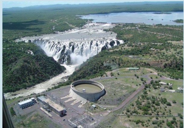
Tremendous: Ruacana falls.