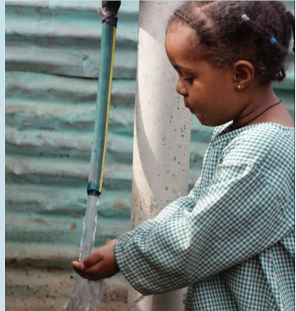
Help for the people around Gulu.