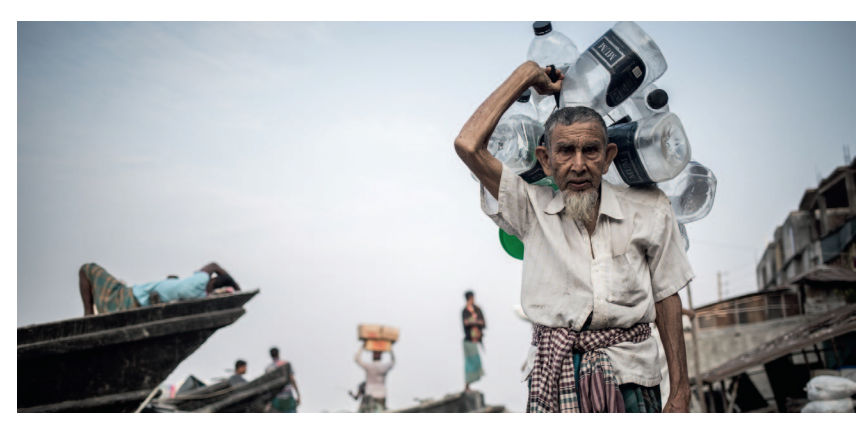
Traders benefit from improved market access in Khulna.

Yes, absolutely. In cities in particular it is easier to involve the population in decision making – once again because the areas in question are smaller. In this respect cities can become an instrument of democratisation, and of equality between men and women and active participation of the poor.