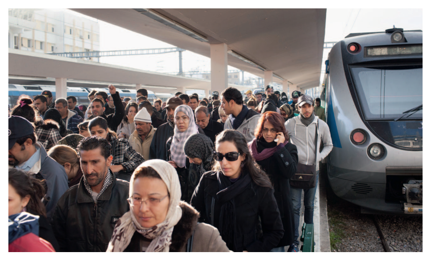
Public transport in Tunis is reaching its limits.

The project will be carried out by the public company Société du Réseau Ferroviaire Rapide de Tunis (RFR), which was founded specifically for this purpose. KfW Development Bank is involved in financing the construction of the suburban railway track on behalf of the German Federal Government. Other donors include the European Investment Bank, the French development bank