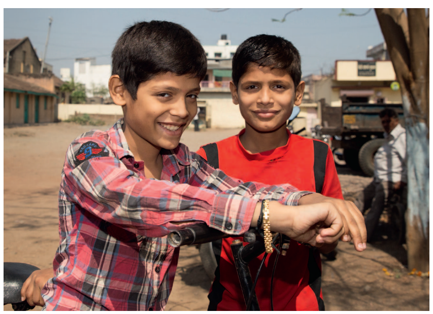
Children are less likely to suffer from diarrhoea if their drinking water is clean.