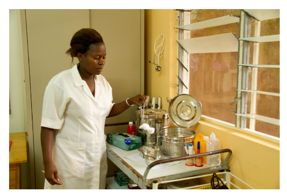
Nurse at a hospital in Uganda.

However, this is not the remit of development policy. The risk is too high that the use of public development cooperation funds (official development assistance) in TVET for the preparation of skilled worker migration will frustrate developmental goals . The developmental goal of promoting training capacity in developing countries for employment in the partner country should be strictly separated from Germany's labour market goal of attracting skilled workers to the