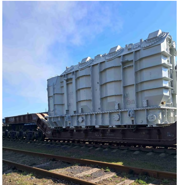
A transformer while being transported.

More than 25 private and public companies across Ukraine benefit from the KfW contribution to the UESF. These companies are active in the subsectors of generation, distribution, transmission, and storage of energy and heat. Large projects of national significance as well as small regional and decentralized projects are supported, allowing energy companies to remain economically viable despite the war situation. The ability to respond quickly and effectively to the diverse demands of the energy sector underscores the central importance of the UESF in ensuring energy supply in Ukraine.