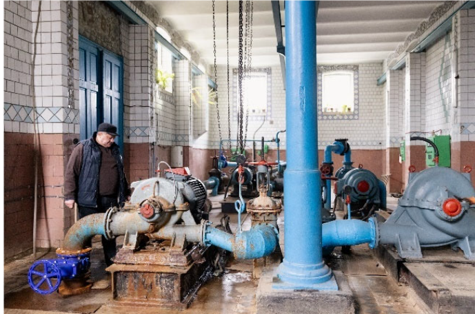
This water pumping station has been operational since 1895.

are to ensure the sustainable use of water infrastructure, improve water and sanitation service delivery, and strengthen Chernivtsi as a supportive community for IDPs.