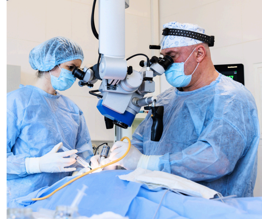
A 3-year-old child is undergoing surgery in the Okhmadyt Children's Hospital.