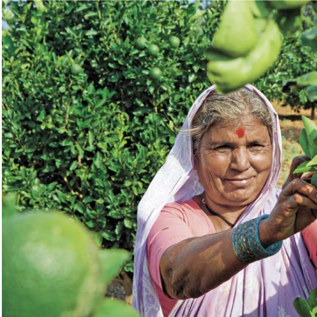
Women now have two or three harvests a year and sell the surplus at the market.

INDIA: EROSION CONTROL IN WATER CATCHMENT AREAS BEARS FRUIT