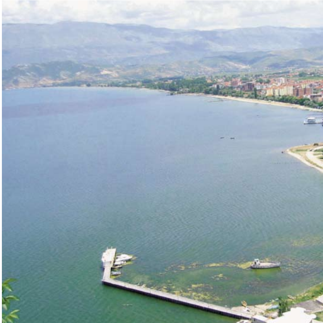
An efficient wastewater system protects the World Heritage Site of Lake Ohrid.

The Prespa region in the area where Albania, Macedonia and Greece meet contains real natural treasures. Lynx and brown bear live in the woods, rare species of pelican and cormorant nest in the wetlands, and fish that harkens back to the ice age swim in the lakes along with other species that only occur here. This extraordinary diversity makes the entire Prespa region an ecosystem of global significance. UNESCO has declared Lake Ohrid a World Heritage Site.