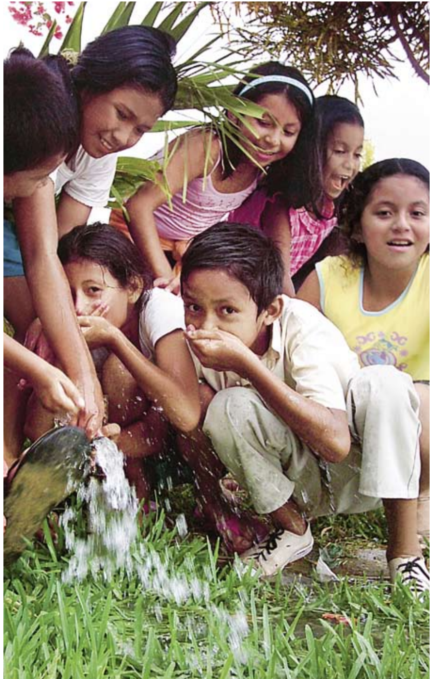
"Water for all" is the aim of Peru's water sector reforms.

In order to achieve good governance within the water services companies, they will also be strengthened internally. This includes not only staff training but also greater participation by the general public, which in the future will be better represented on the supervisory boards. Contracts with the government establish the targets, incentives and penalties as well as a code of conduct for the companies.