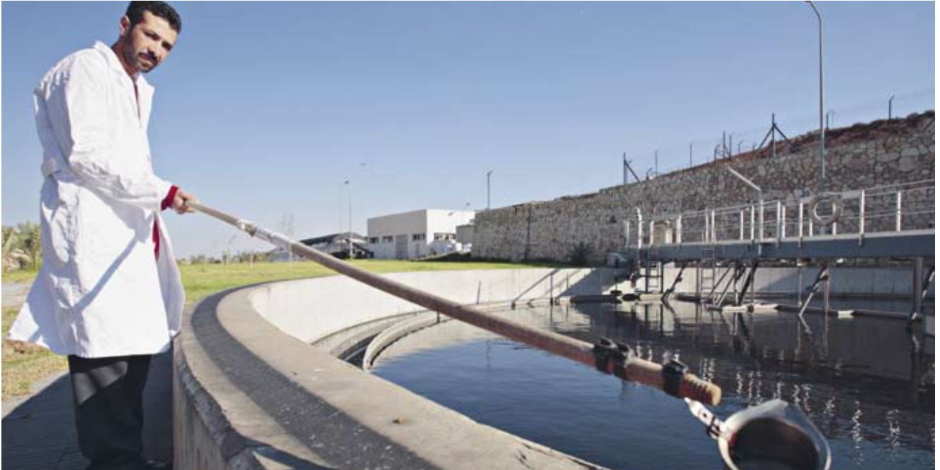
The quality must be right before wastewater can be reused.

Water is a very scarce commodity in dry Tunisia. With over 26 reservoirs and several thousand wells, the country currently uses almost all of its renewable water resources. Yet in some regions the groundwater level is continuously falling, and the "blue gold" is being additionally endangered by wastewater and contaminated water percolating from solid waste dumps. Agriculture consumes more than 80% of the water. The Tunisian Government is doing everything possible to use the available resources more efficiently and to protect them from pollution by applying a comprehensive IWRM strategy.