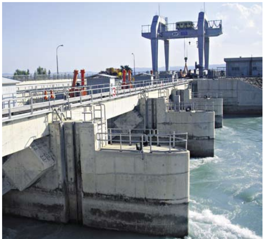
Energy from water

This shows that Integrated Water Resources Management is essential in all sectors – management that equally considers the environment and all user groups.