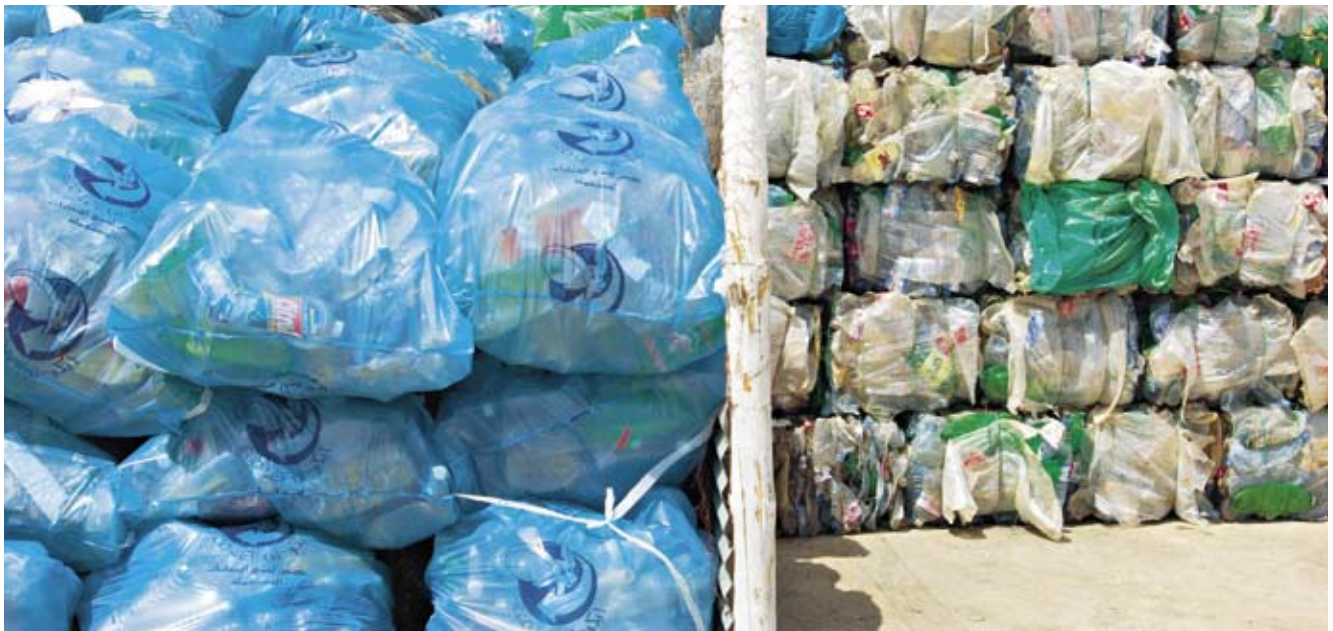
Modern waste management returns recyclable materials to the economy.

measures to collect wastewater, treat it and, where possible, allow it to be reused. Recycling the organic substances and nutrients contained in wastewater plays an increasingly important role in this regard. KfW Entwicklungsbank is making approximately EUR 1.6 billion available for such wastewater management projects.