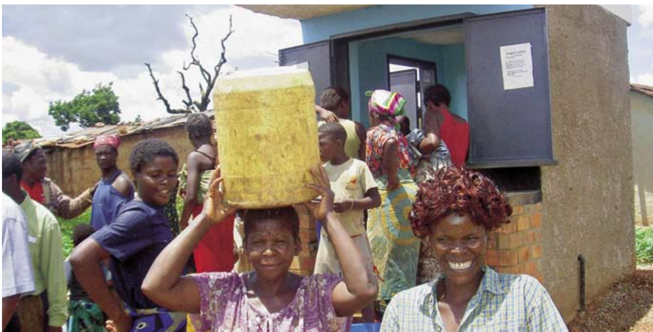
Water and more: kiosks are also meeting points for the community.

All the new water kiosks in Zambia's poor neighbourhoods are centres of bustling activity. Girls and women carry their canisters to fetch water for washing clothes or cooking. Anyone who quickly needs to buy some flour or sugar can find it here too, because the water kiosks serve also as small shops selling items of daily use. Not only do women no longer need to walk for hours to fetch water, but the clean water available in the vicinity also costs less than the dirty water from the tankers of illegal water vendors.