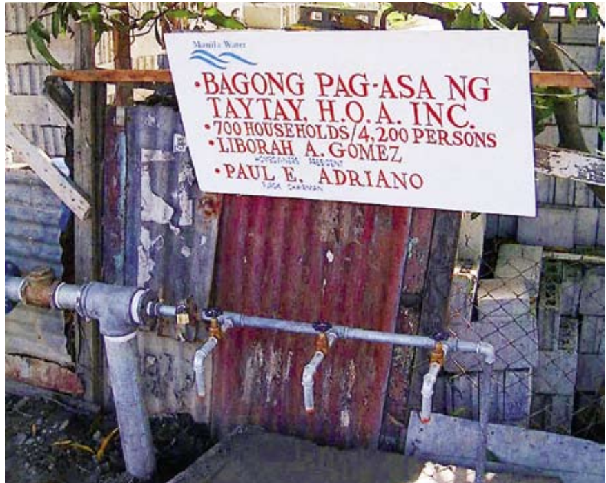
Access to clean drinking water for poor households in Manila.

Providing a regular water supply is often particularly difficult in large conurbations with millions of inhabitants. One possible problem is that water pipes are in such poor condition that the water does not even reach the people and must be purchased at considerable cost from mobile vendors, as in Manila, for instance. In the eastern part of Manila, DEG co-finances investments in the modernisation of the supply network.