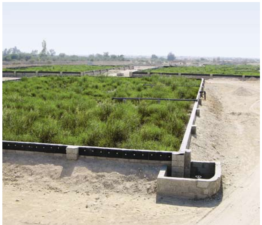
Wetland systems using plants for treating water: an innovative environmental technology.

The system is composed of an upstream oil separator, the plant-based treatment facility, in which micro-organisms bond to contaminants, and a downstream saline area. At the end of the process chain the water is treated and can be evaporated leaving salt, which can be processed to industrial salt. The wet-park is designed to treat 45,000 cubic metres of process water a day. It complies with the new environmental legislation of Oman and is setting an example for sustainable, proven environmental technology. Germany is providing management capacities and the technology, thereby ensuring a continuous transfer of know-how. DEG provided a USD 28 million quasi-equity loan for this progressive environmental engineering project.